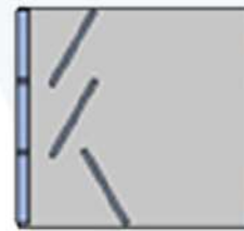
Type AS = asymmetric tip arrangement