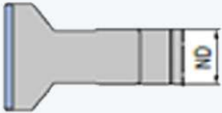
Position of boss (NAL) 2