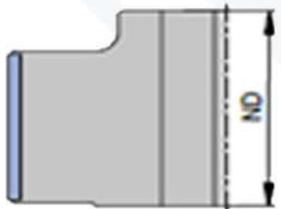
Position of boss (NAL) 4