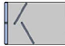
Type S = symmetric tip arrangement